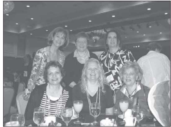
NYSPAN Dinner at the 2010 National Conference.