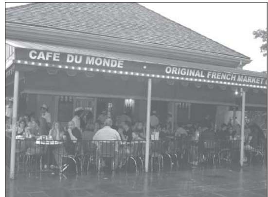
Cafe' Du Monde, a coffee shop on Decatur Street in the French Quarter in New Orleans, popular for their cafe' au lait and French style beignets.